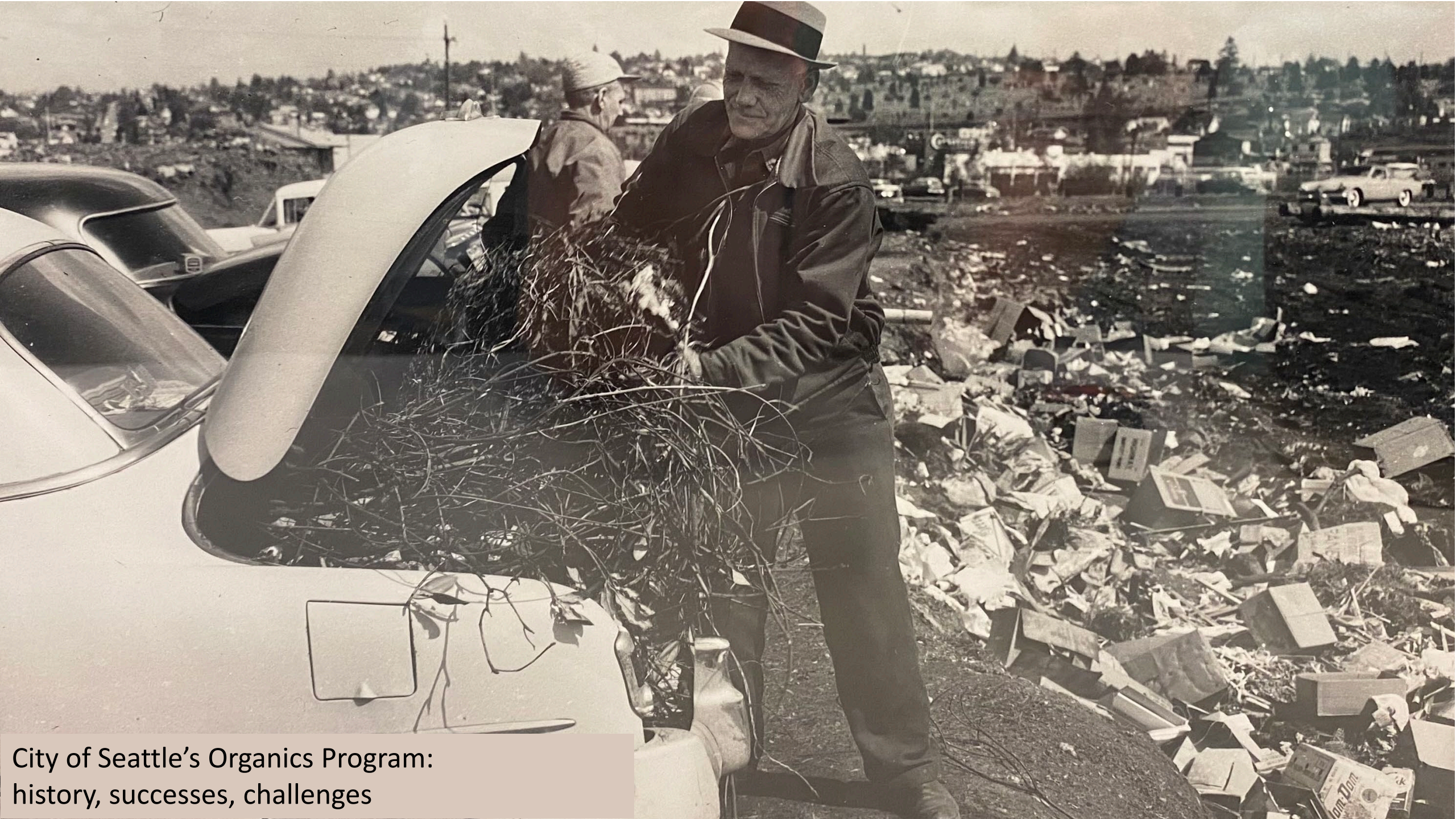
City of Seattle's Organics Program: history, successes, challenges